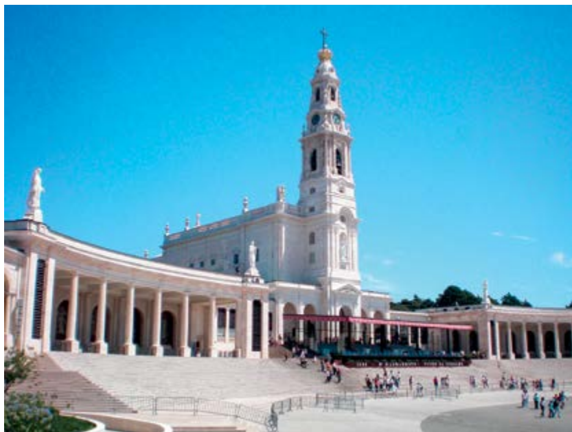
The Basilica of Our Lady in Fatima

adapted to this sinful age to LOVE GOD again with all our heart. The devotion of CONSOLING GOD can inflame in an incalculable number of Catholics a burning love of God in our time of widespread religious indifference and hatred of supernatural truth. The ability to give consolation is a great encouragement for us poor sinners, that in spite of our misery we can really love God more and more, and our love can be active, not empty words.